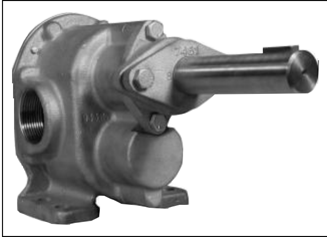
MODEL N13500-21- UPPER DRIVE MODEL N13510-21 - LOWER DRIVE