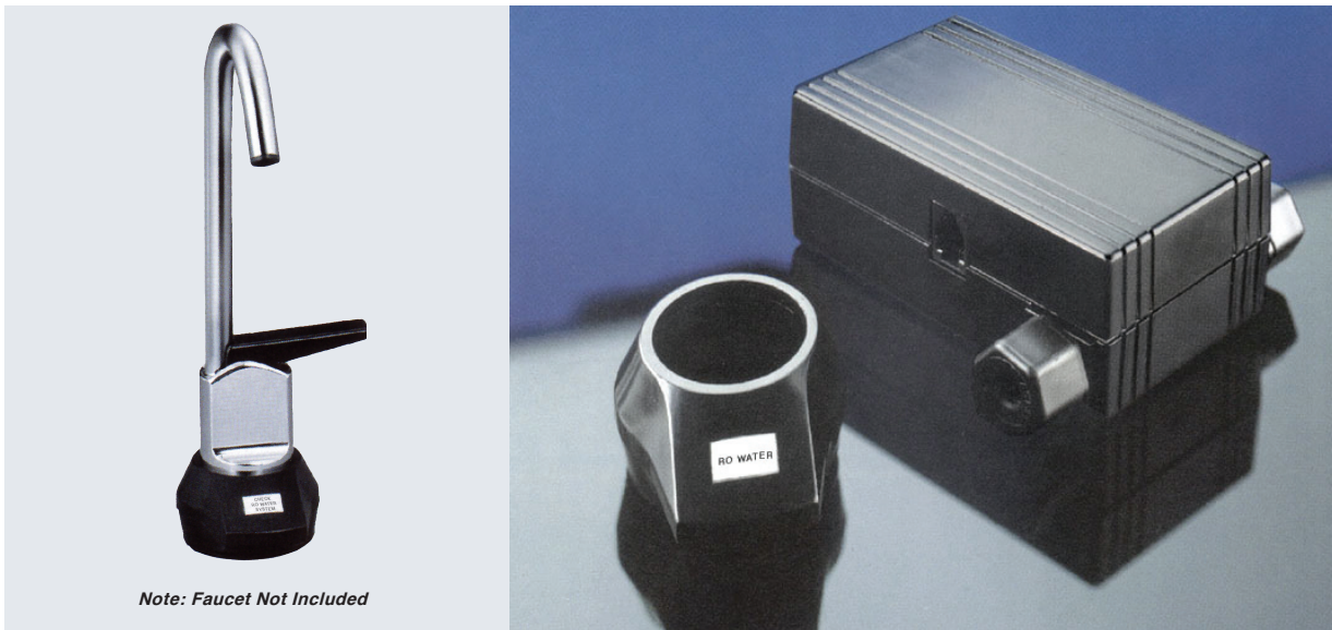
Note: Faucet Not Included