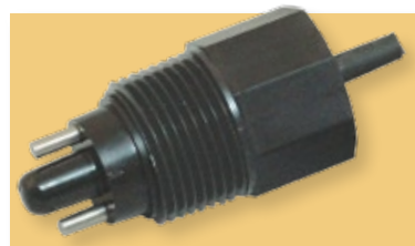
Conductivity Sensor CSA

and range of instrument — up to 20,000 \mu\text{S/ppm} is the normal maximum range of use.