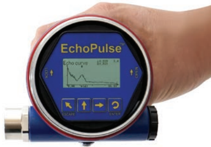
Echo Signal Return Curve Shown