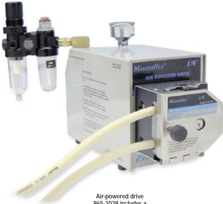
Air-powered drive 965-1029 includes a High-Performance pump head