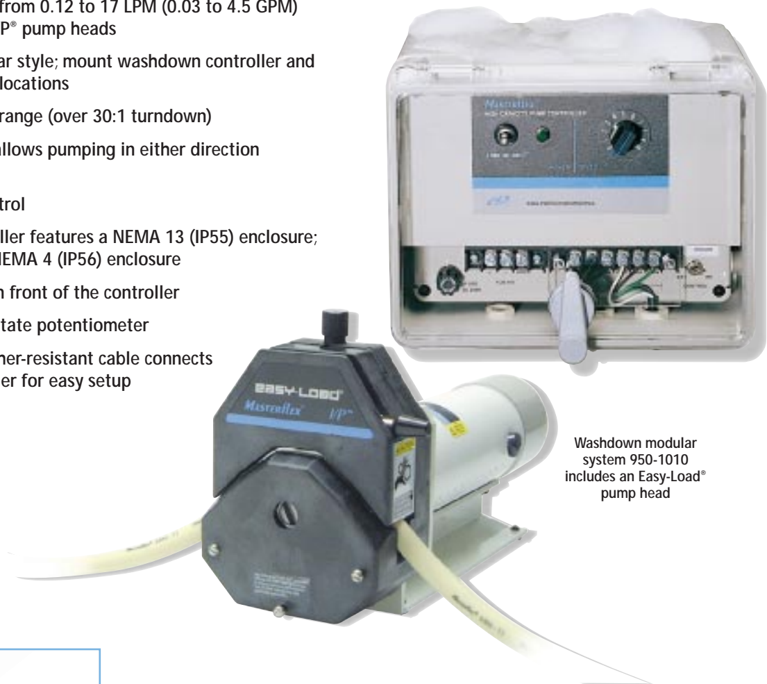
Washdown modular system 950-1010 includes an Easy-Load® pump head