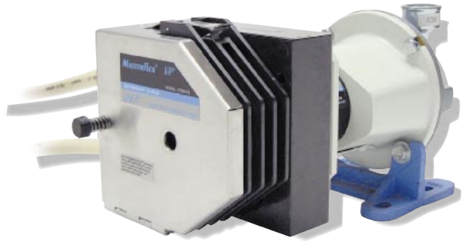
Air-powered pump 960-1020 includes a High-Performance pump head