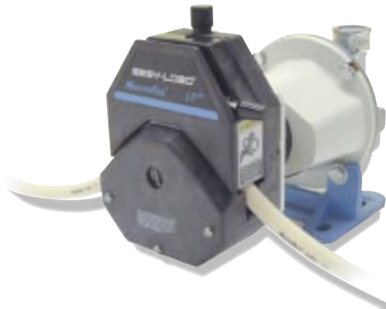
Air-powered drive 950-1020 includes an Easy-Load® pump head